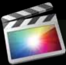
Final Cut Pro X

Learn most advanced video editing suite from experts